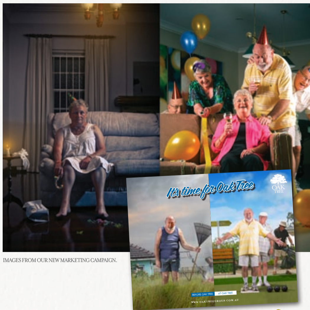
IMAGES FROM OUR NEW MARKETING CAMPAIGN.

If you answered yes to any of the above then we think it IS time you considered Oak Tree. Join the many who are inspired by the fresh start a new year brings and upgrade to a new home and lifestyle while you can still enjoy it. We encourage you to come by to any of our villages, speak to our residents and hear how they enjoy their new lifestyle. They will tell you it's the best decision they ever made.